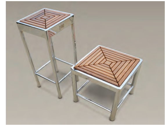
Sakkho Teak Tiles