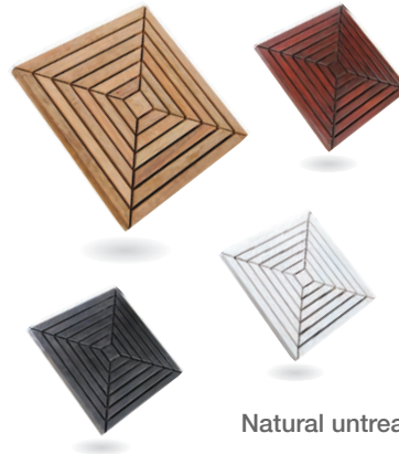
Natural untreated wood

Available in different models Sakkho tiles are versatile in their application